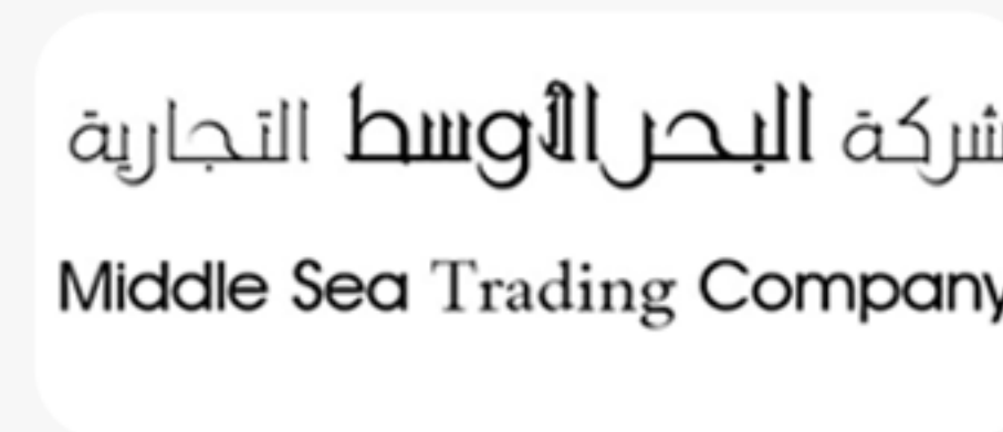
Middle Sea Trading Company