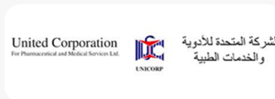
United Corporation for Pharmaceutical & Medical Services