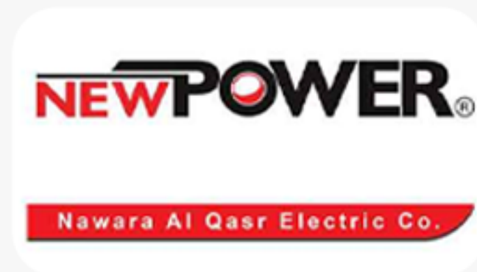
Nawara Al Qasr Electric Company